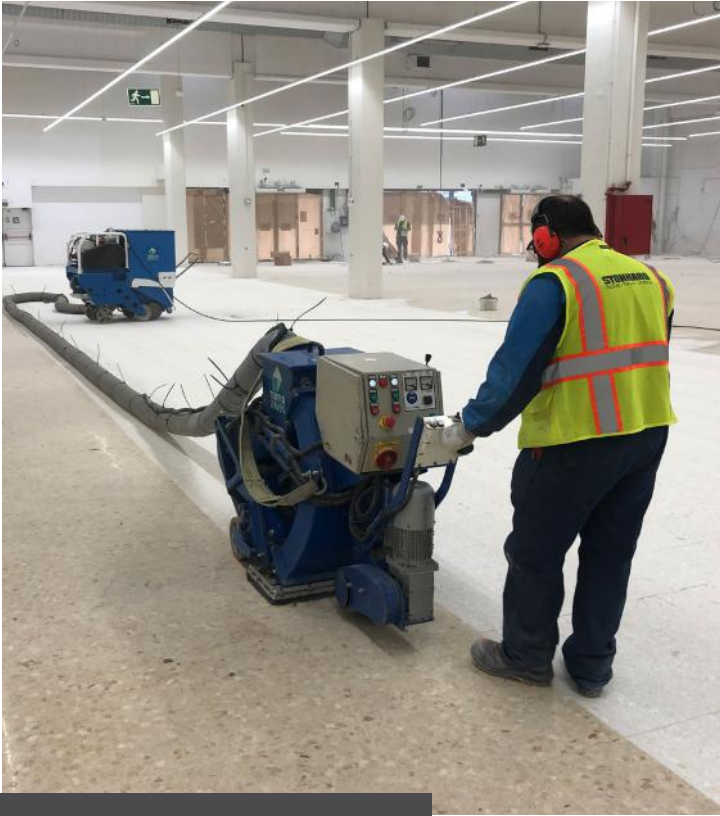
2700 m 2 durable flooring solution

The Stonhard Difference Stonhard is the unprecedented world leader in manufacturing and installing high-performance polymer floor, wall and lining systems. Stonhard maintains 300 Territory Managers and 175 application crews worldwide who will work with you on design specification, project management, final walk through and service after the sale. Stonhard's single-source warranty covers both products and installation.